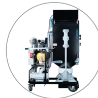
HEPA + Longopac (LP) version

The VCE3000C dust extractor impress with high performance and are based on an optimal combination of maximum depression and the highest air flow volume.