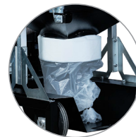
Longopac system for filter unit