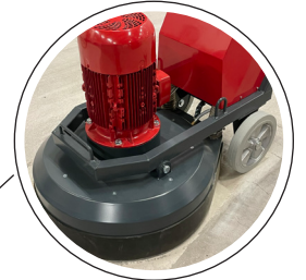
Our patented drive system ensures maximum and reliable operational performance.