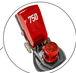
Powerful, robust, and stable floor grinder!