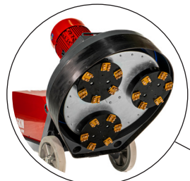
3 grinding heads, 280 mm / 11" in diameter, cast in one piece of ductile iron and laser-hardened.