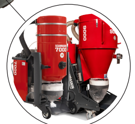
Recommended dust extractors: Scanmaskin 7000 WS Scanmaskin 9000 WS