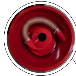
Built-in pre-separators, 90 % pre-separation