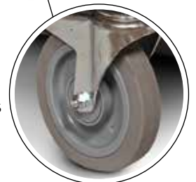
200 mm large swivel wheels