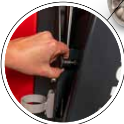
Height-adjustable cyclone for flexible transport