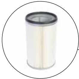
Hepa 14 filter 99.995 % filtration rate