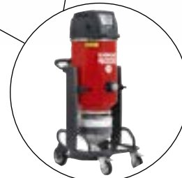
Recommended vacuum: Scanmaskin 4000 WS