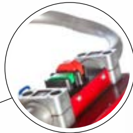
Equipped with on/off buttons