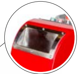
Water tank 18 liters / 4,7 US gallons